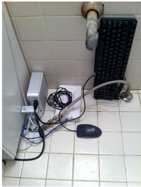
Figure 1. Hydrobeacon collects water-pressure data and uploads it to a server in real-time using an Internet communication interface.